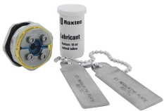
C RS T Ex -tiiviste